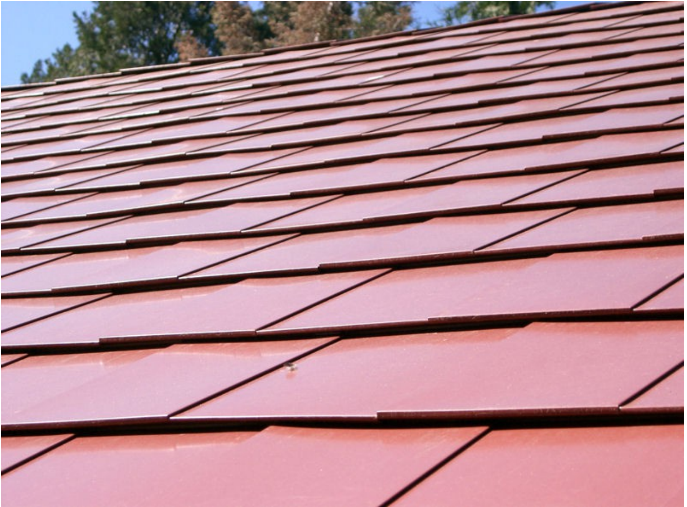
Product description for Fine Metal Roof Tech's Quadro Panels